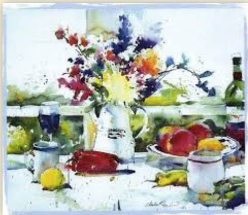
"La Jolla Flowers"