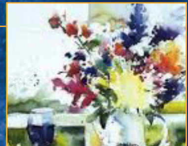
Detail from "La Jolla Flowers"