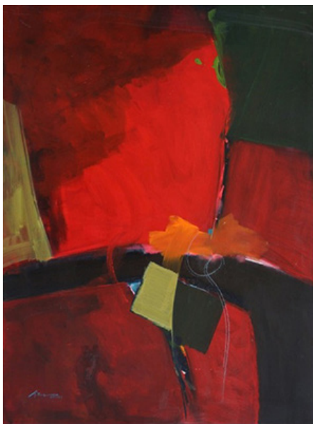
Pat Dews, "Ascending Red"