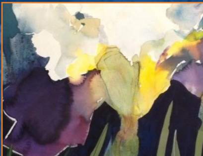
Detail from "Iris Essence II"