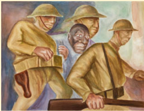
Crawford Gillis, "In Custody (Project for a Southern Armory)"

I came upon a watercolor by Crawford Gillis (1914-2000), "In Custody (Project for a Southern Armory)," that was painted in 1936 and is part of the permanent collection of the Montgomery Museum of Fine Arts. The fear depicted in 1936 is still as bracing as today but it brought home for me the fact that not enough has changed over all these years.