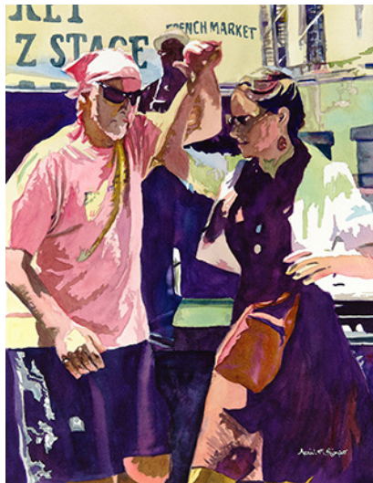
April Rimpo, "Full Swing"

April Rimpo's painting "Full Swing" was selected for inclusion in the 2020 Missouri Watercolor Society's International Exhibition, which will be held in Barcelona, Spain from April 24 - May 30, 2020. The 169 paintings selected by Thomas W. Schaller will be displayed at The Barcelona Academy of Art and The European Museum of Contemporary Art.