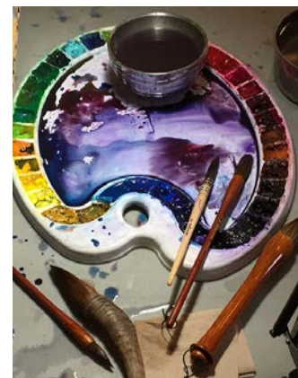
Dogan’s palette and brushes