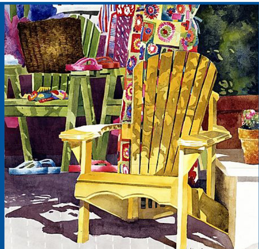
"All Decked Out"