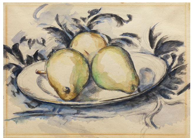
Paul Cézanne, "Three Pears," ca. 1888-1890, Watercolor, gouache, and graphite on cream laid paper, 9 1/2 x 12 3/16 in. The Henry and Rose Pearlman Foundation, on long-term loan to the Princeton University Art Museum.