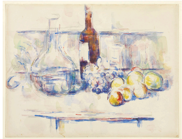
Paul Cézanne. "Still Life with Carafe, Bottle, and Fruit" 1906, Watercolor and soft graphite on pale buff wove paper, 18 7/8 x 24 5/8 in. The Henry and Rose Pearlman Foundation, on long-term loan to the Princeton University Art Museum.