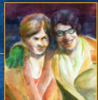
Detail from "Green Gloves"