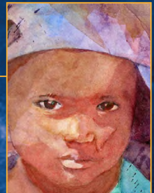
Detail from “Looking In”