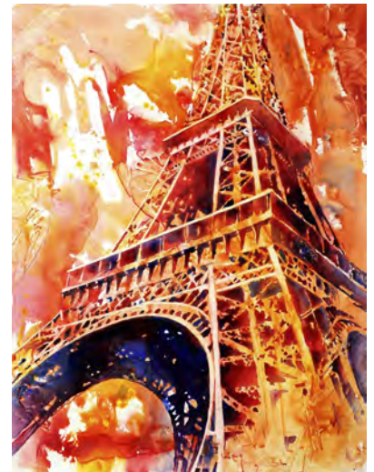
Ryan Fox "Video Killed The Radio Star"