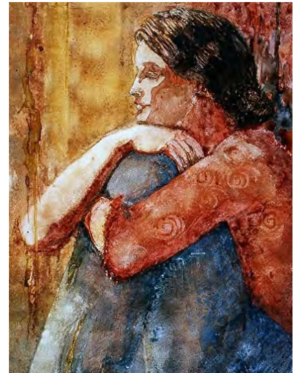
"Deep in Thought"

My studio is located at Kudzu Art Zone in Norcross. The group of printmaking artists at Kudzu is having a printmaking show of our work July 22-Aug 2nd.