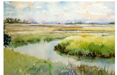
Dwight Rose, "Fripp Island"