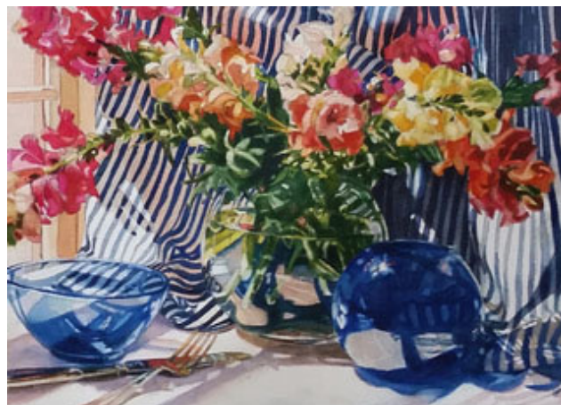
Anne Hightower-Patterson, "Morning Snaps"

I follow both my color and value studies when painting.