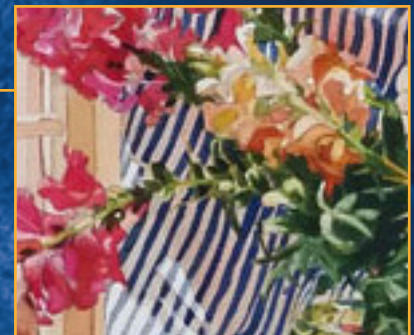
Detail from "Morning Snaps"